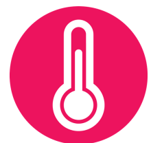
Response & Protocols