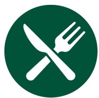
Banquet Food & Beverage