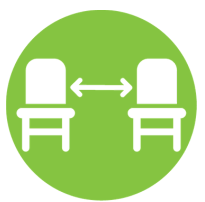
Meeting & Event Space