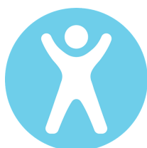
Amenities & Recreation